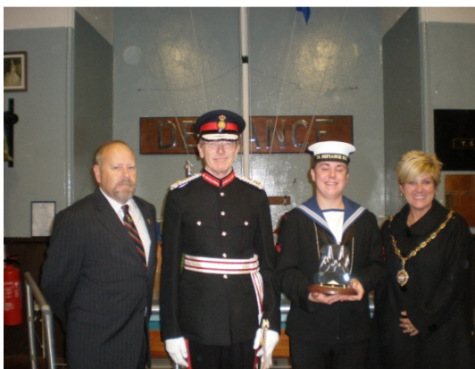
Sea Cadet Unit Awards