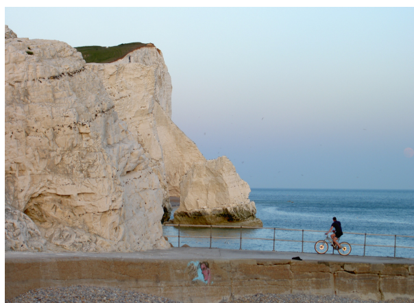
Seaford Head at Splash Point