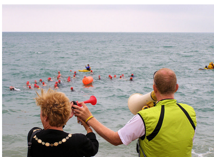
Starting the Seaford Triathlon

It's impossible to go through the whole of my mayoral year as I have attended over 200 engagements myself not including that of my deputy, but I can assure you that each and every one has been a most enjoyable experience, I hope that I have managed to highlight the wonderful community that we have and to all the lovely people that I have met and worked alongside this year, once again may I thank you for everything that you have done for me and the town.