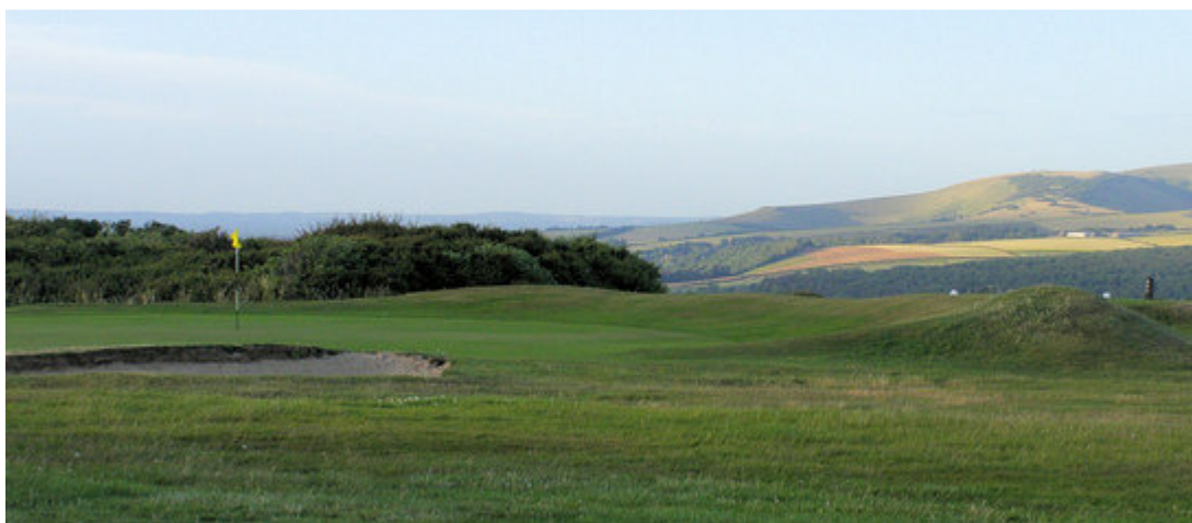
Seaford Head Golf Course

In conclusion, may I thank all of our community groups for their energy, experience and good humour over the past year.