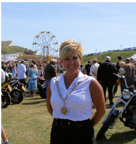
Seaford Bike Fest