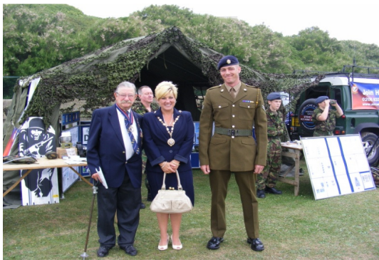
Armed Forces Day