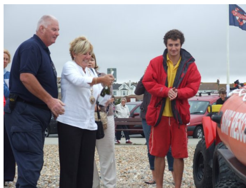
Launching the new Seaford Lifeguard patrol boat.