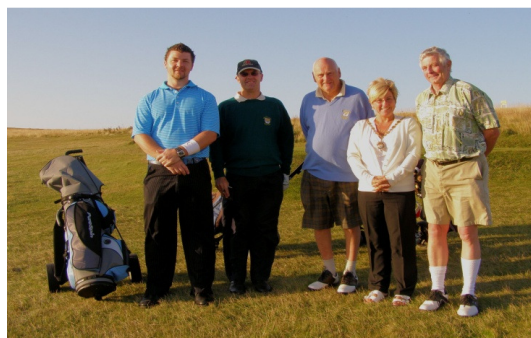
Mayor's Charity Golf Day