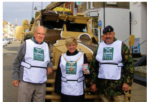
Collecting for Ghurkha Charities