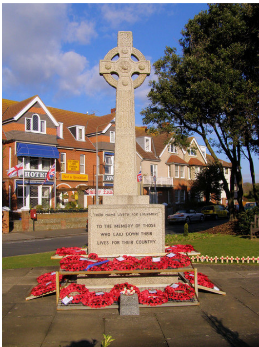
Seaford War Memorial

The Community Services Committee has responsibility for some other facilities and services, including the Martello Fields, the War Memorial and the Allotments and works closely with appropriate bodies who have a relevant interest in them.