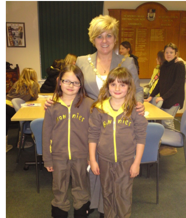
The Brownies "Meet the Mayor"