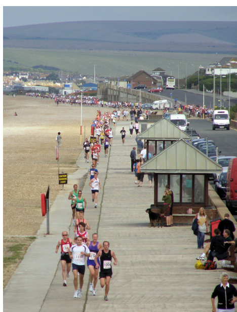
Seaford Half Marathon August 2009

The Council have considered information and changes proposed in relation to the South Downs National Park and the Cuckmere Estuary during 2009/10, it is important that Councillors can receive first hand information from officers of other organisations where their proposals have an impact on the immediate area and beyond. We hope to continue as a Council to influence the decisions being made by others that affect our town.